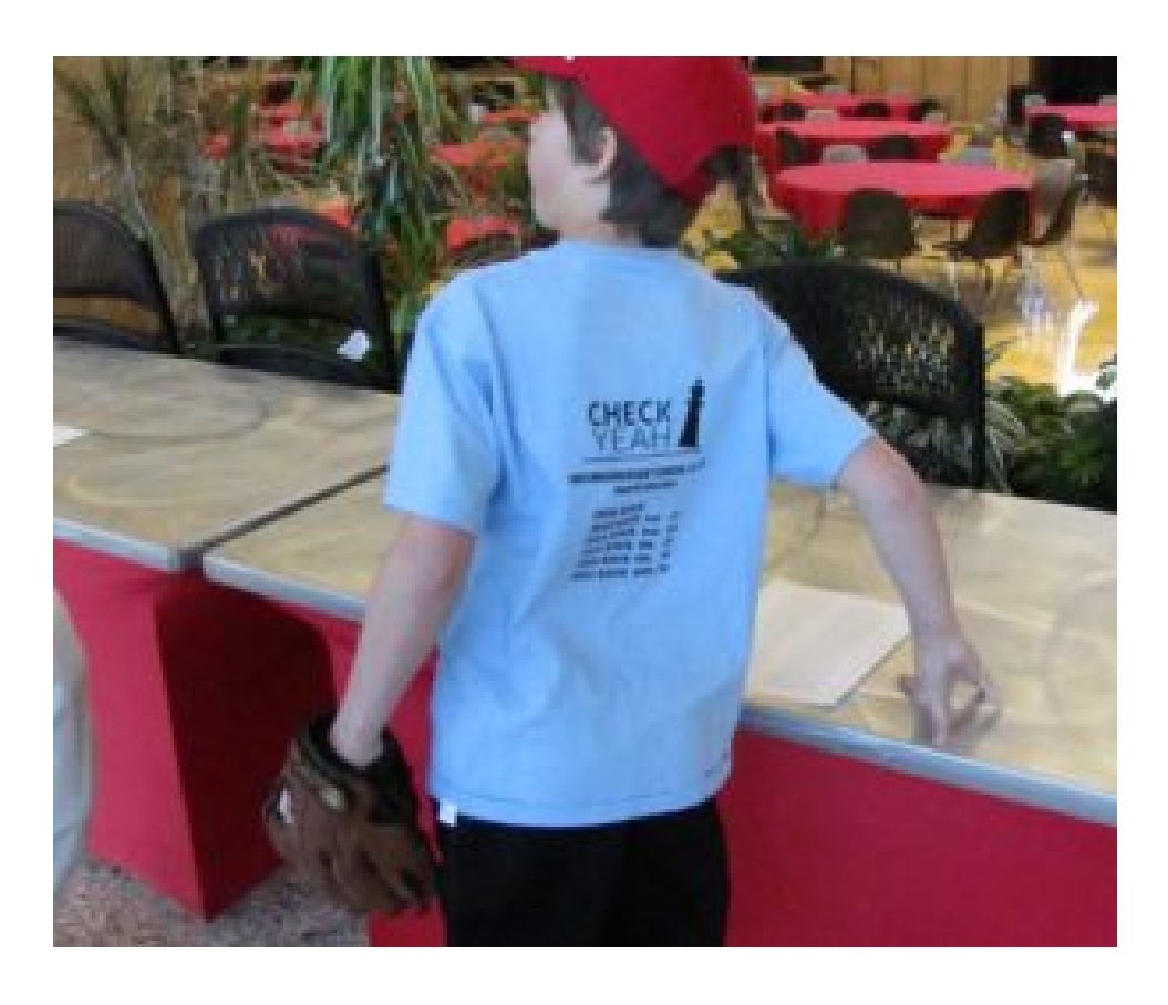
Morningside student just before the start of the 2016 state championship tournament